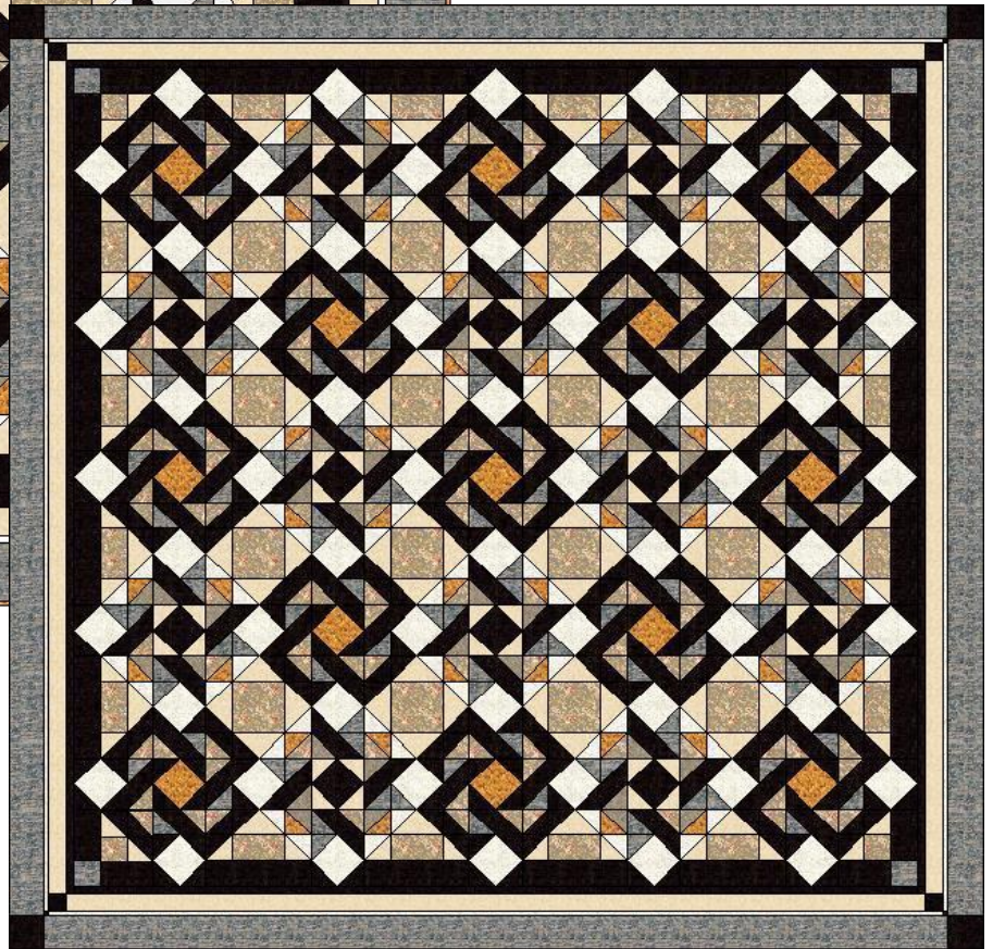
King Size (5 x 5) = 111" x 111"

This pattern requires the following Studio 180 Design Tools: Square Squared Corner Pop