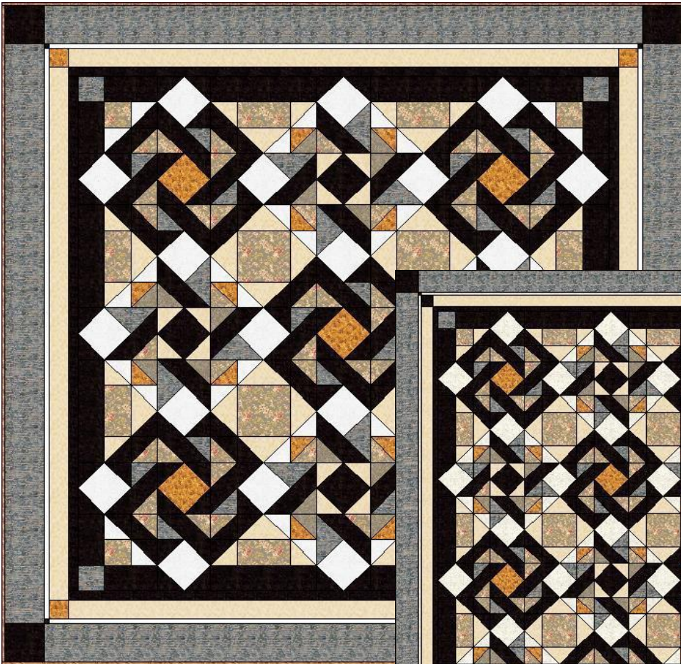
Lap Size (3 x 3) = 75" x 75"